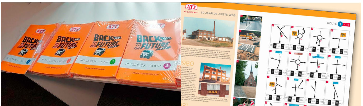
Four different routes, elaborated in “tulip” formula in a clear roadbook, with the story of 60 years of ATF on the left page and the route instructions to be followed on the right.

Maybe you have an idea for such an event and ViaFlavia can help you develop it? Please feel free to contact us, without any engagement.